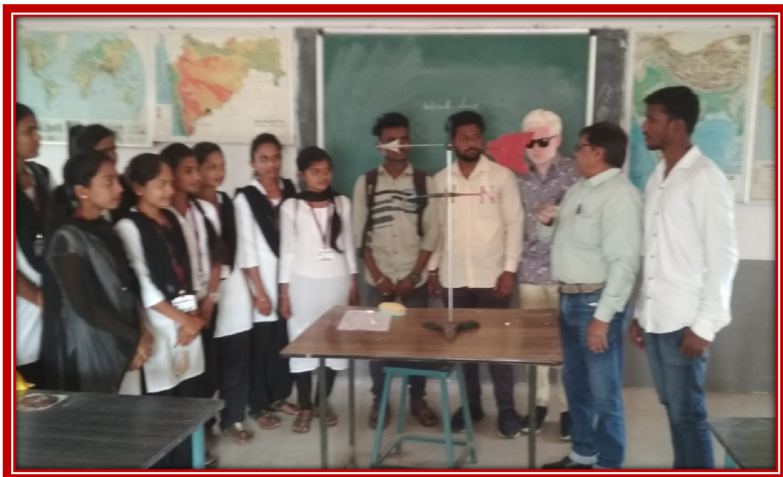
Wind Vane : On the land station the direction is found out with the help of wind vane.