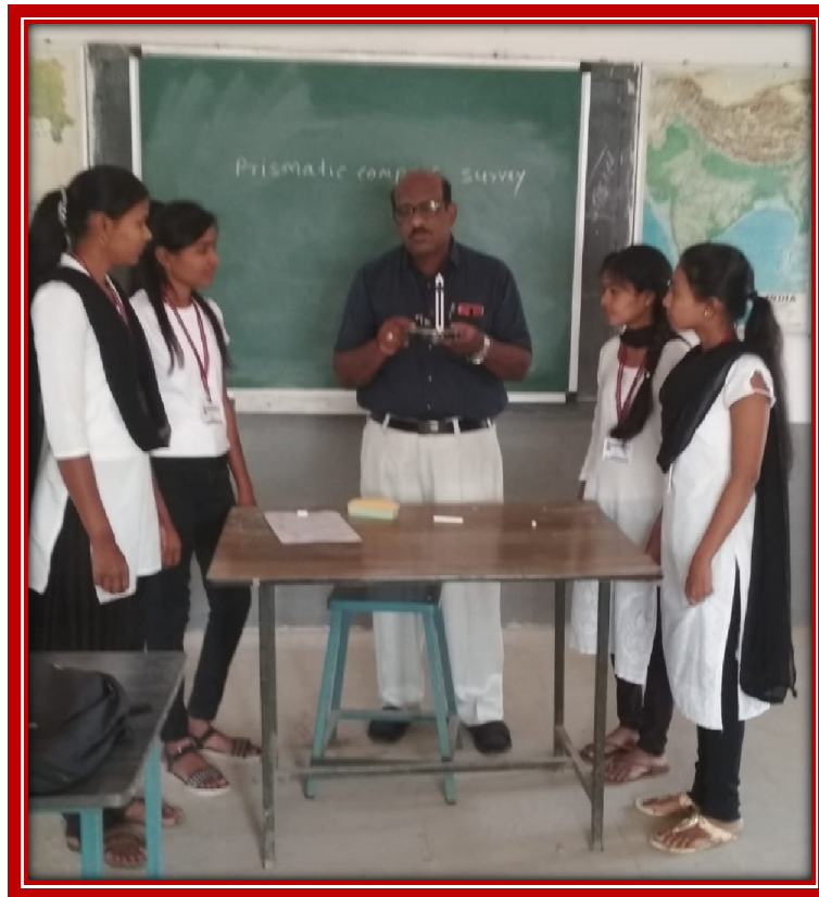
Prismatic Compass Survey