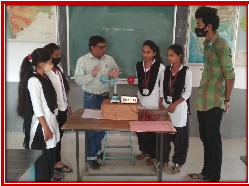
Cup Anemometer: This instrument is used to measure wind speed.