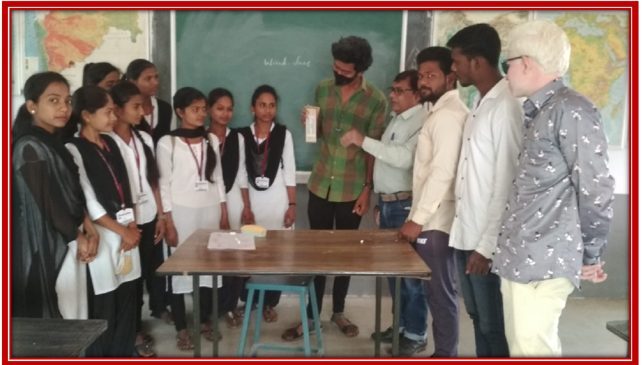
Dry and Wet bulb Thermometer