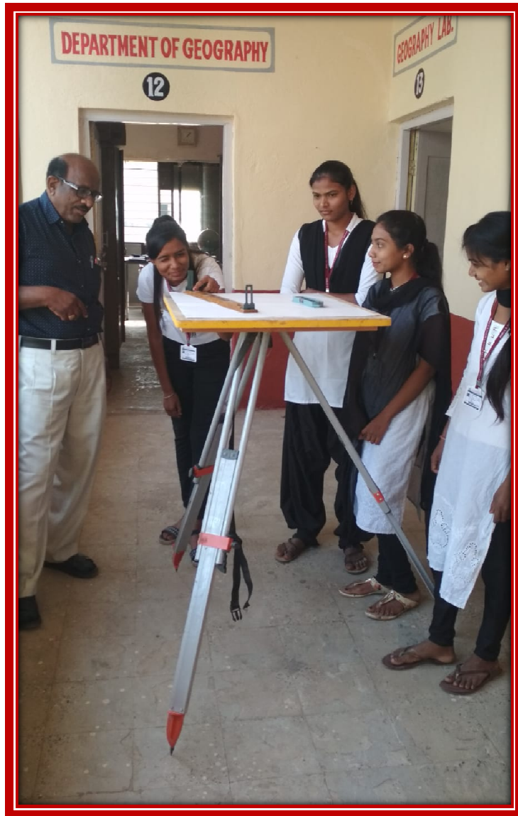
Plane Table Survey