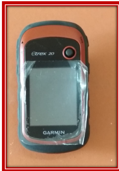
GPS (Global Positioning System)