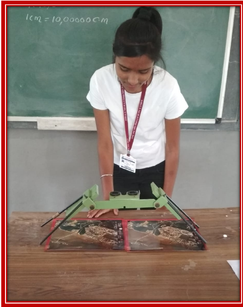
Mirror sterio Scope