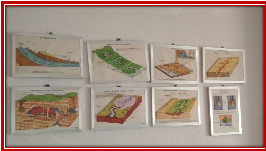
Models (River Depositional and Erosional Work)